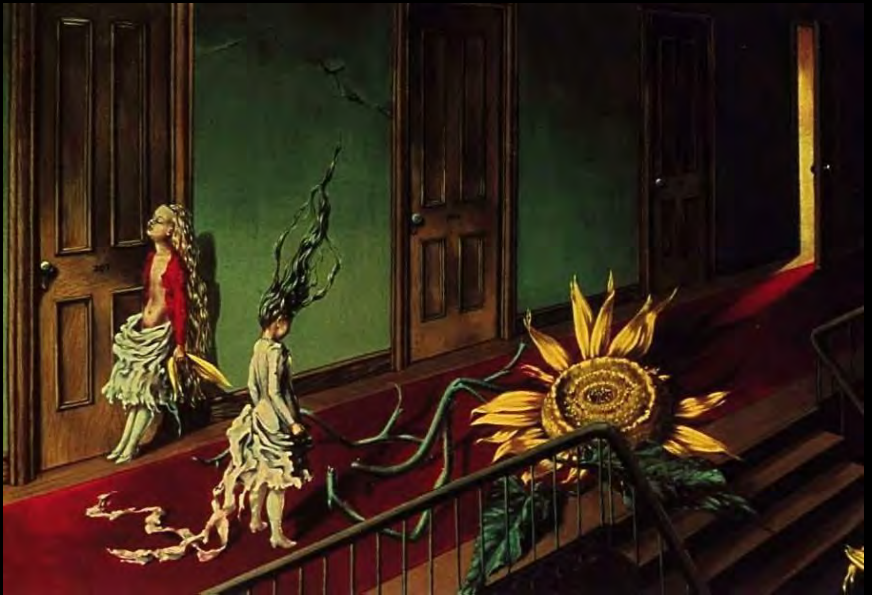
Dorothea Tanning, A Little Night Music , 1946