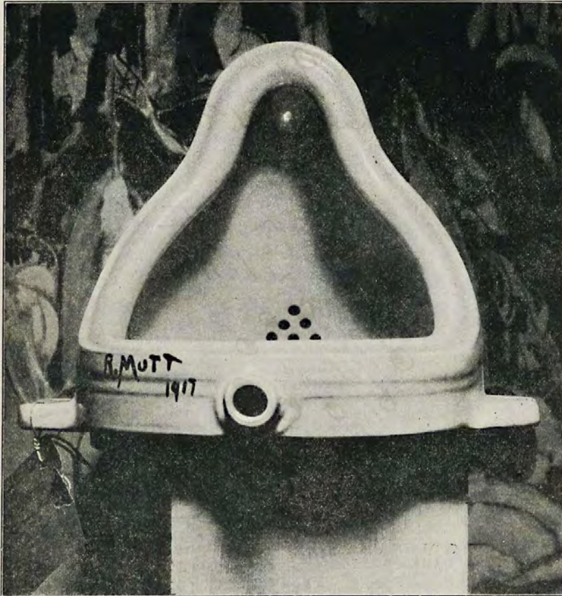
THE EXHIBIT REFUSED BY THE INDEPENDENTS