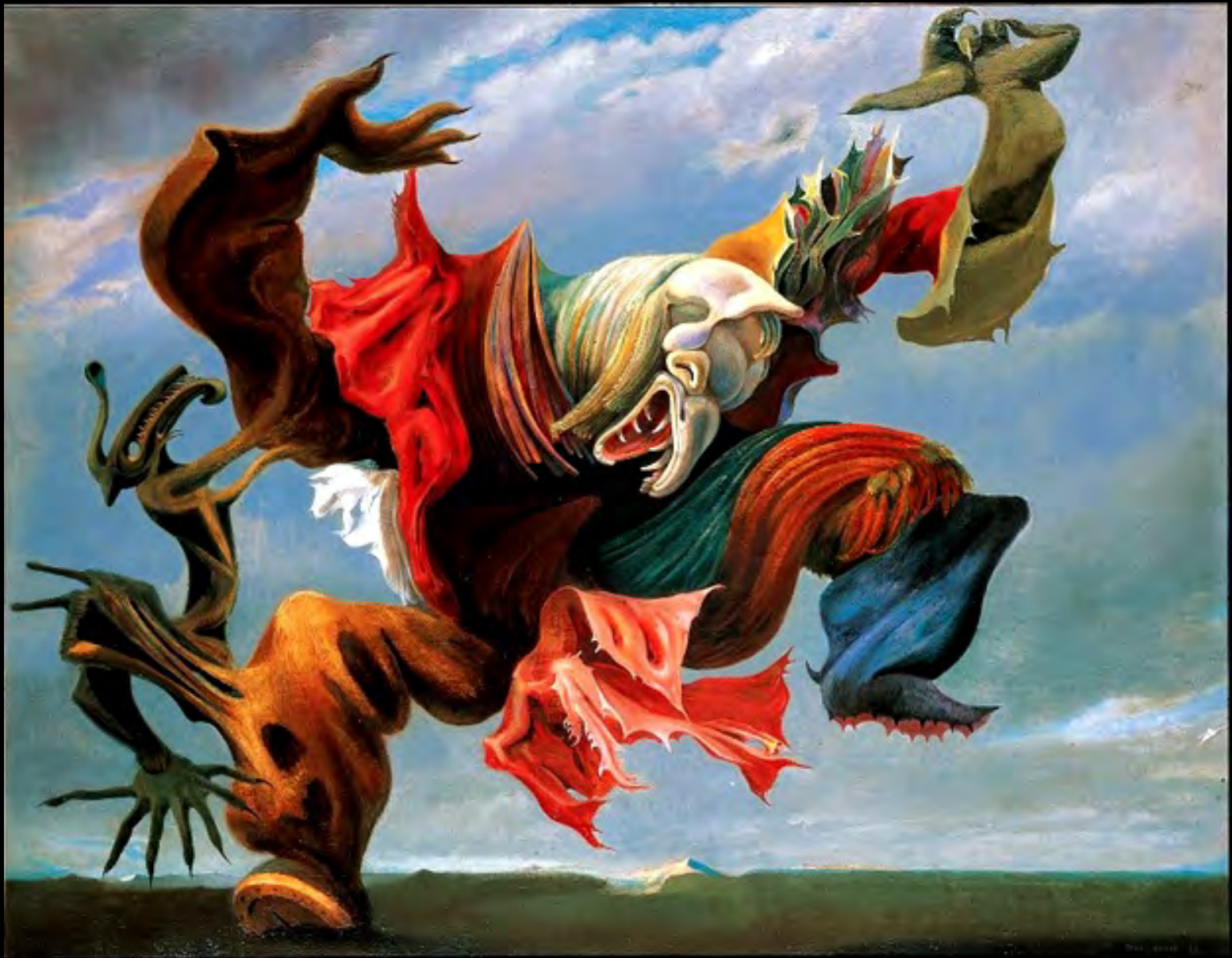
Max Ernst, L'Ange Du Foyer ou le Triomphe du Surrealisme , 1937