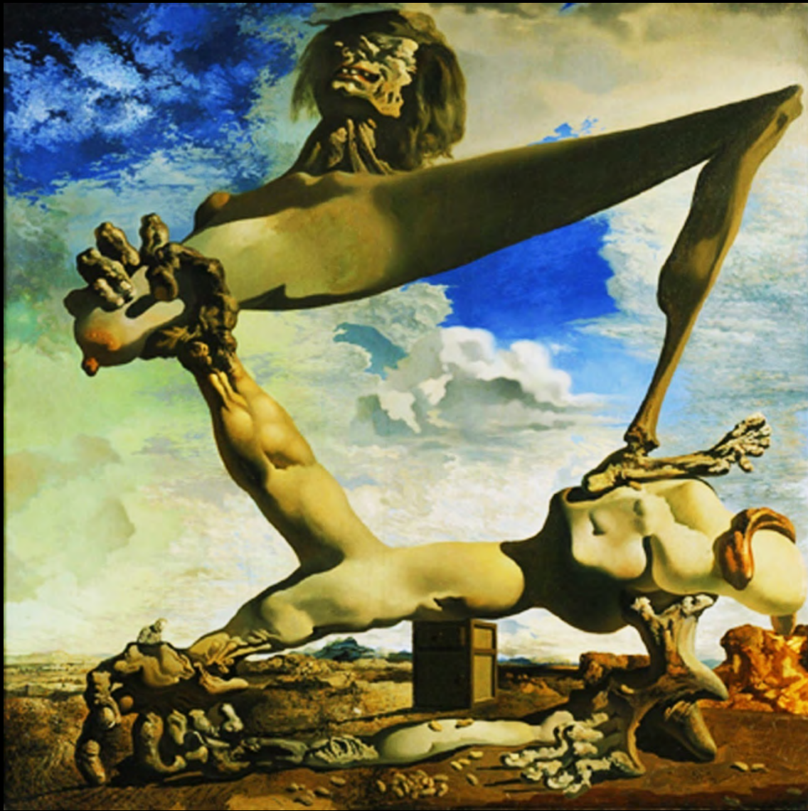
Salvador Dalí , Soft Construction with Boiled Beans (Premonition of Civil War) , 1936